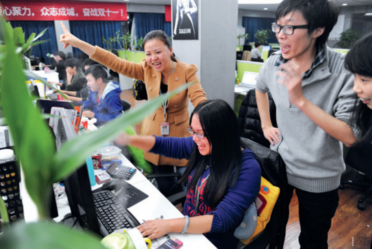
GOOD HARVEST: Staff members of Seven Princesses, a Hangzhou-based e-commerce company, celebrate surging online transactions on November 11