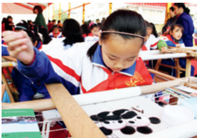
EXPERT EMBROIDERER A girl shows her crafts at the Fifth China Embroidery Culture and Arts Festival, which kicked off in Suzhou, east China's Jiangsu Province, on November 28