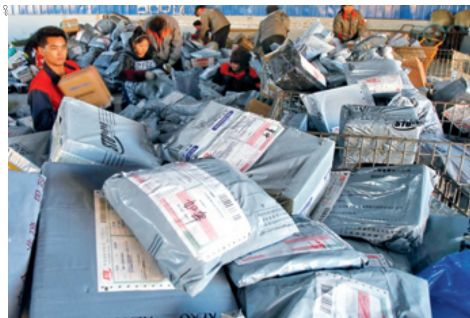
HURRY UP: Parcels pile up at a station of a delivery company in east China’s Jiangsu Province, after the massive promotion on Singles Day, which falls on November 11 each year

October, China cannot be sure whether its export growth will fully recover.