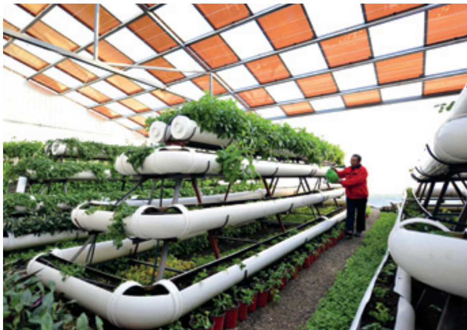
NEW PLANTATION Farmers from Jimo of east China's Shandong Province harness vertical farming technology to grow vegetable in a photovoltaic greenhouse on November 27