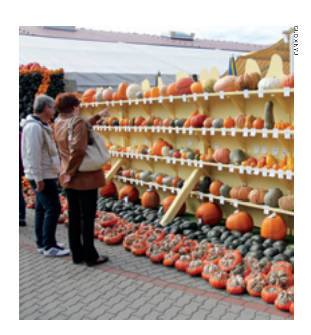
Visitors browse pumpkins on display at an exhibition in Klaistow, south of Berlin, on September 23. The exhibition featured more than 100,000 pumpkins of 450 varieties