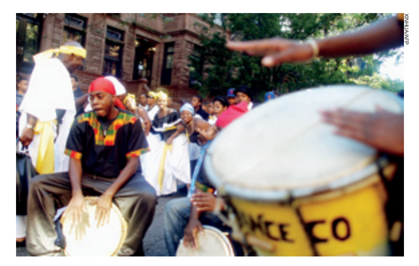
Dancers and musicians perform during the African Day Parade and Festival in Harlem in New York City on September 23. Thousands of participants and spectators from the African diaspora joined the annual celebration of African culture