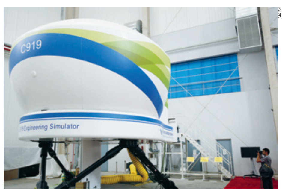
OFF TO A GOOD START An engineering simulator of the C919, a large passenger aircraft developed by China, was on show in a lab of Shanghai Aircraft Design and Research Institute on September 21. So far, C919 has received 330 orders

The industry's performance this year has