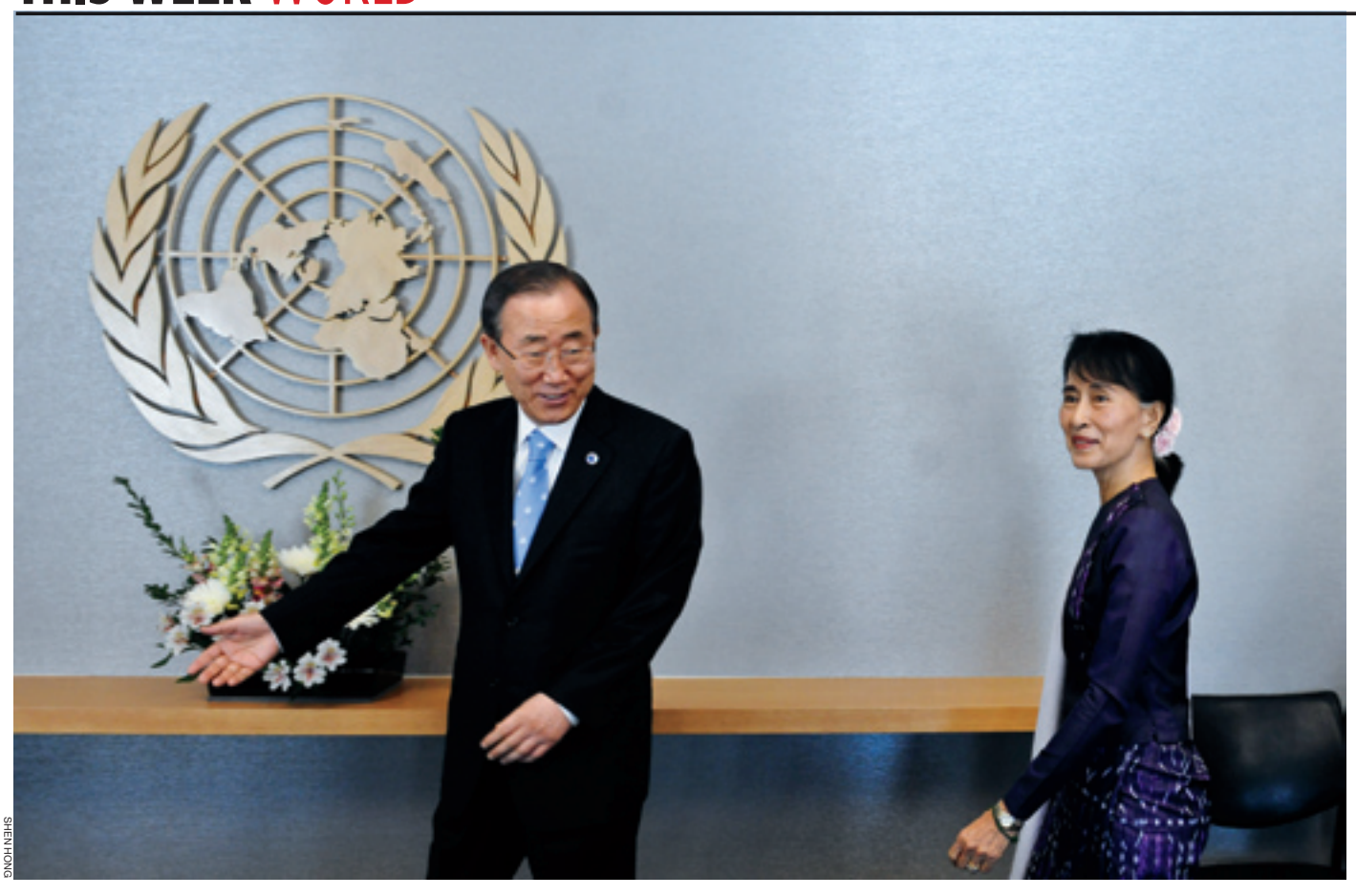
UN Secretary General Ban Ki-moon meets with Myanmar's opposition leader and parliamentarian Aung San Suu Kyi at the UN headquarters in New York City on September 21