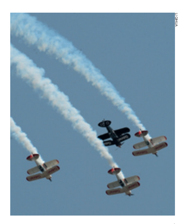
South African jets put on an air show on September 22 during the Africa Aerospace and Defense Expo held at an air force base on the outskirts of Pretoria