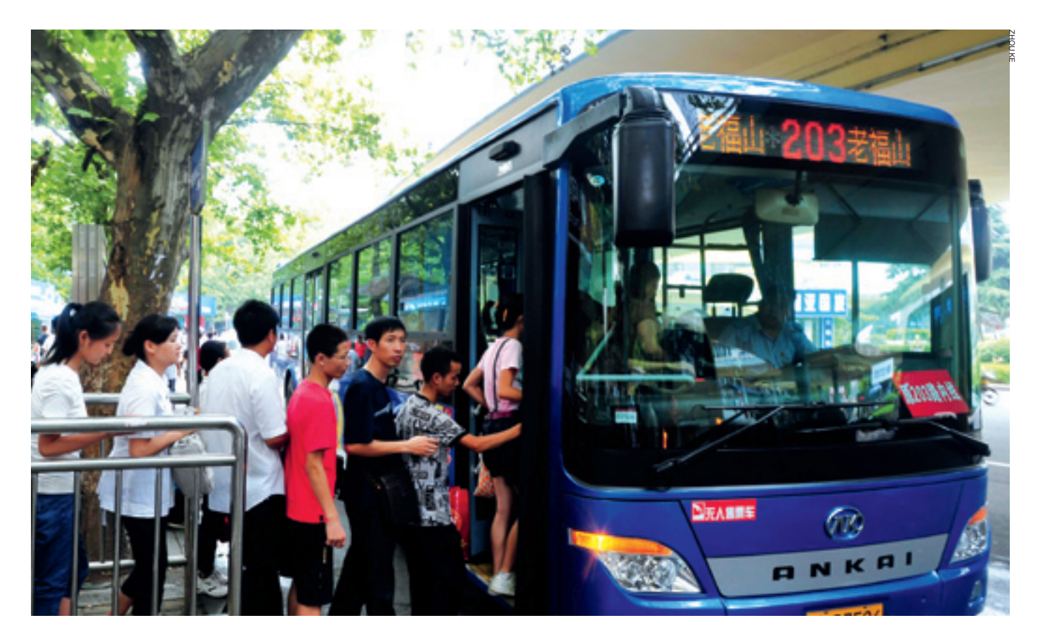
GREEN TRANSPORTATION: Residents get on a new-energy bus in Nanchang, capital of central China's Jiangxi Province on July 18, 2011