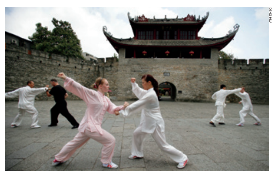
KUNG FU TRIP French martial artists train in Liuzhou, Guangxi Zhuang Autonomous Region, on September 2. They excelled in this year's French National Martial Arts Competition and were sent to Liuzhou to study for 20 days

About 427 million Chinese have been insured by the programs at the end of August, according to the Ministry of Human