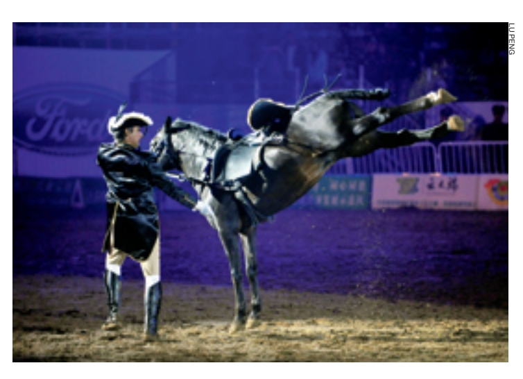
HORSE SHOW A foreign rider performs with his horse at the second International Horse Culture Festival in Dalate Banner in Erdos, Inner Mongolia Autonomous Region, on August 26

Baodao Healthcare is the first joint mainland-Taiwan hospital to be registered in Beijing since the signing of the landmark Cross-Straits Economic Cooperation Framework Agreement in 2010. The hospital is scheduled to officially go into operation in October, expanding inpatient capacity to 100 beds.