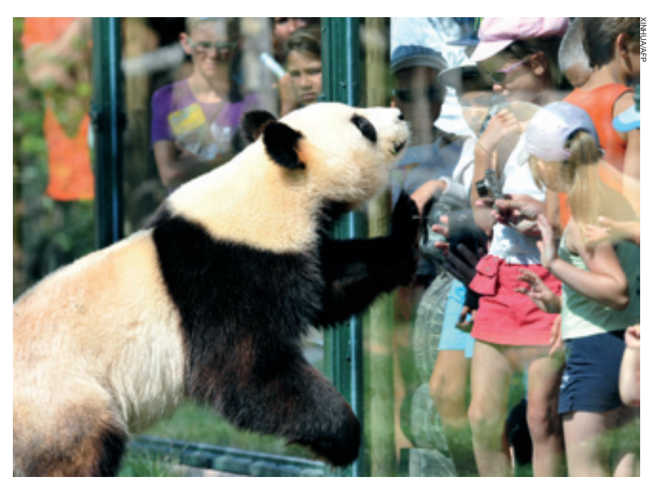
Visitors watch Huan Huan, one of the two giant pandas that arrived in France earlier this year from China, at Beauval Zoo in Saint-Aignan, central France, on August 23