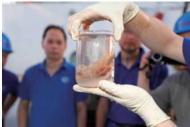
DEEPSEA FINDING An organism sample captured from the Mariana Trench in the Pacific Ocean by China's manned submersible Jiaolong . The Jiaolong set a new national diving record on June 27 after reaching 7,062 meters below sea level. It collected three water samples, two sediment samples and one organism sample, placed a marker, and made several experiments during the dive

The program will mobilize more than 3,000 technicians nationwide to build a three-dimensional and dynamic "geodetic" network with high precision, it said.