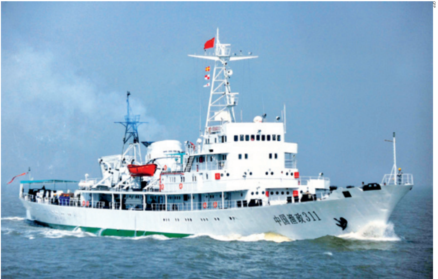
FISHERY ADMINISTRATION: China Fishery Administration Ship No. 311 , the largest of its kind, departs from a port in Guangzhou, capital of Guangdong Province, for the Xisha Islands on March 10, 2009

Yongxing Island, the seat of Sansha Municipal Government, has relatively good