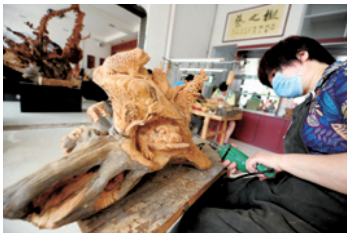
WOODCARVING CITY An artisan works on a woodcarving artwork in Guangfeng of central China's Jiangxi Province on June 26. Guangfeng has more than 108 woodcarving factories and has vowed to build itself into the country's top woodcarving base