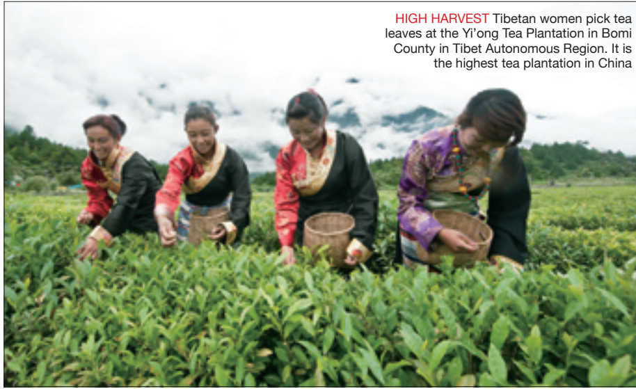
HIGH HARVEST Tibetan women pick tea leaves at the Yi'ong Tea Plantation in Bomi County in Tibet Autonomous Region. It is the highest tea plantation in China