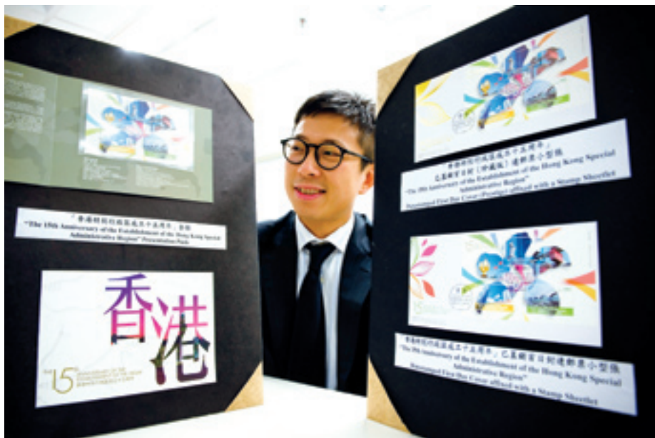
HAPPY ANNIVERSARY A Hongkong Post worker shows special stamps and first day covers published for celebrating the 15th anniversary of the establishment of Hong Kong Special Administrative Region that fell on July 1

China is to invest 517 million yuan ($81.25 million) to build a modern national network to monitor movements in the Earth's crust and other Earth sciences in the next four years, according to an announcement by the National Administration of Surveying, Mapping and Geoinformation (SBSM) on June 26.