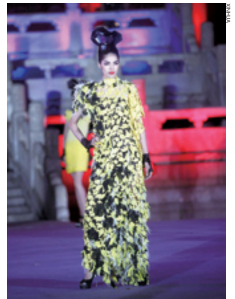
FASHION AND FUN A model poses in a fashion show at the opening ceremony of the 2012 International Tourism Festival at the Imperial Palace in Beijing on June 26

Missions set in a three-year plan for China's