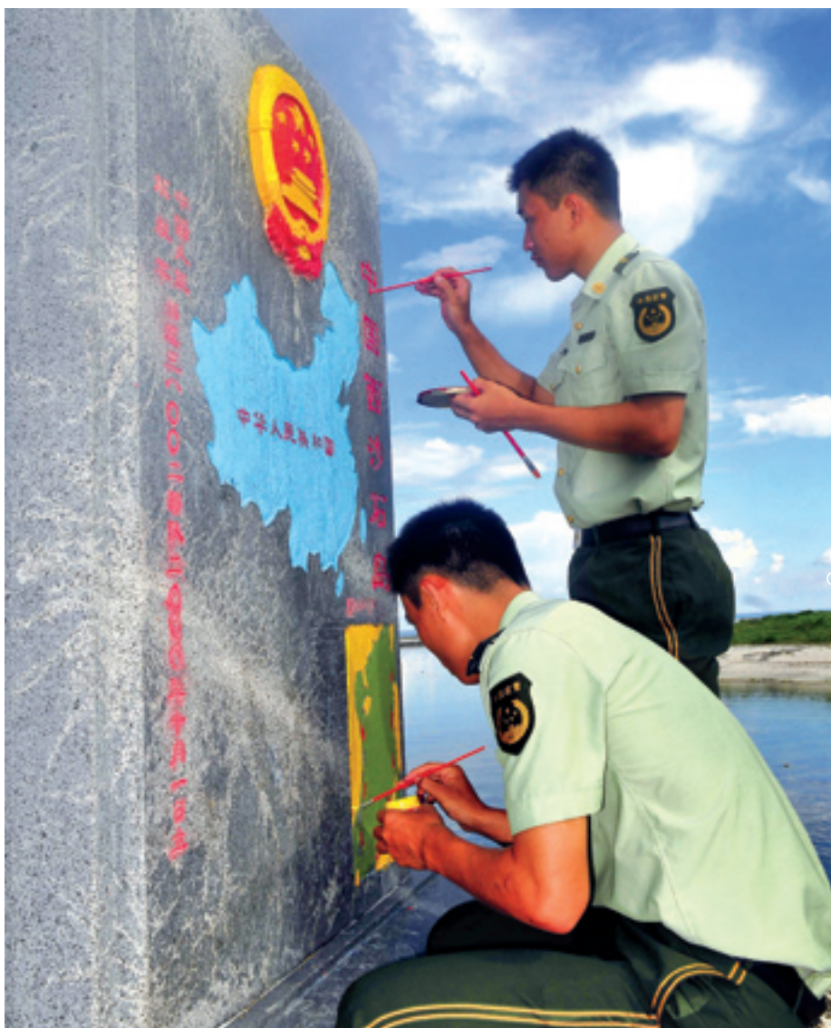
GUARDING THE ISLANDS: Border guards stationed on the Xisha Islands clean up a boundary monument on August 24, 2009

infrastructure such as a dock, airport, hospital, bank and post office. Yet infrastructure is still quite poor on other islands inhabited by fishermen, where there is no adequate supply of fresh water and electricity for daily use.