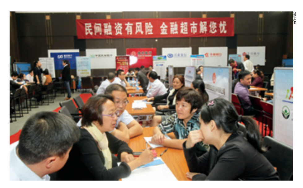
A HELPING HAND: Business owners in Nantong, Jiangsu Province, talk to employees of guarantee companies at a government-held monthly meeting aimed at providing better services to financially strained small businesses