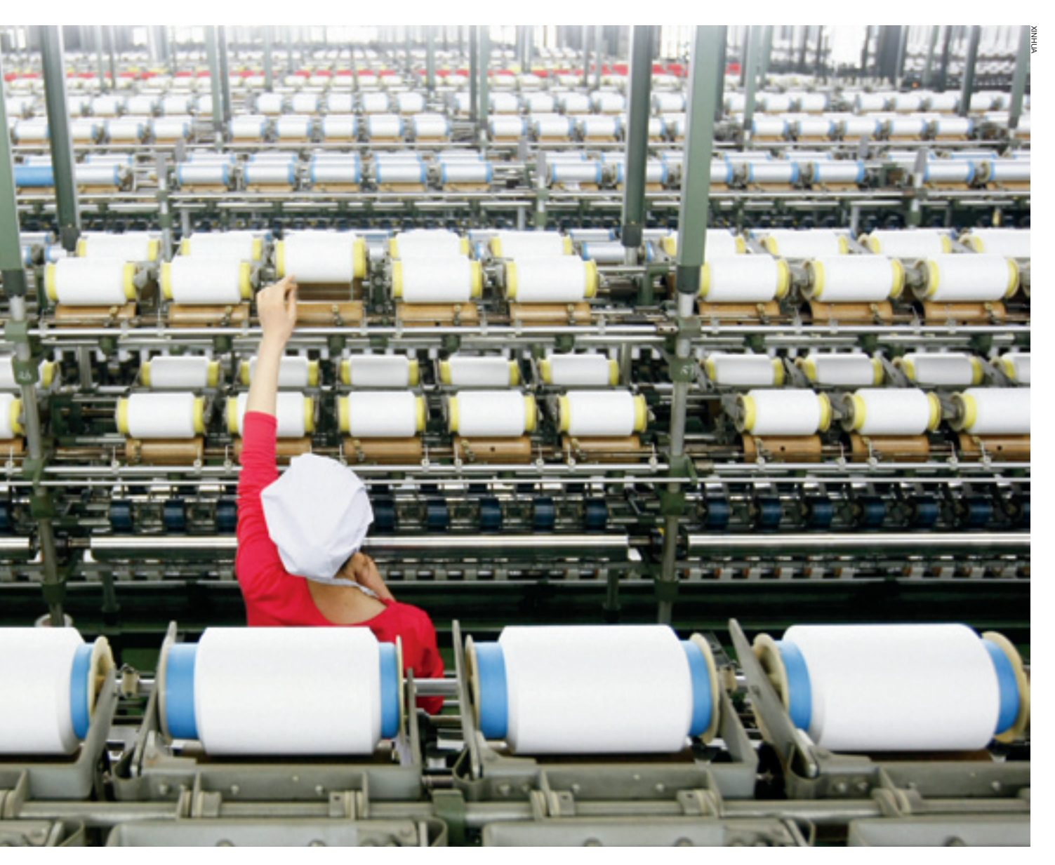
FAST ROLLING: A worker at the Zhejiang Yongxin Group plant, a leading textile manufacturer in China