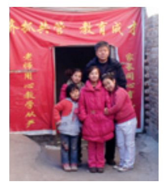
22 A Man and His Dream Giving his all for migrant children