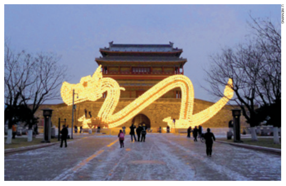
ZODIAC SIGN A 50-meter-long and 16-meter-tall dragon-shaped lantern, composed of 4,000 smaller lanterns, is built at the square of Yongdingmen Park in Beijing in celebration of the coming Year of the Dragon according to Chinese lunar calendar

In Tibetan-inhabited areas of southwest China's Sichuan Province, religious personnel are covered by the same social security schemes that are available to local rural residents.