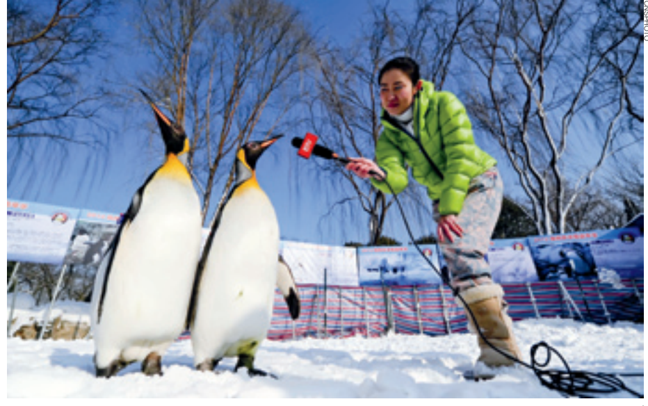
DIFFICULT INTERVIEW A reporter visits two penguins who are set to appear at a carnival in Beijing's Taoranting Park during the upcoming Chinese Lunar New Year that starts on January 23

China's State Administration of Radio, Film and Television said that the launch of 3D TV services would boost the country's consumer spending, as consumers would begin to replace China's 500 million TV sets with new 3D ones.