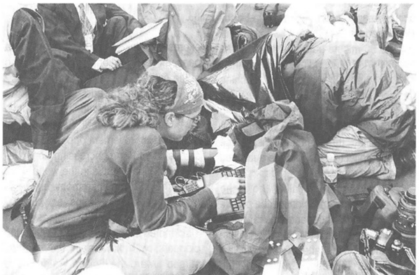
A foreign journalist delivering an on-the-spot report.

The Chinese-made aerial refueling tanker which made its debut at the show attracted special attention. When the refueling tanker dragging a long pipe flew over the square along with oil-receiving